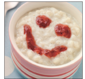
RICE PUDDING DESSERT